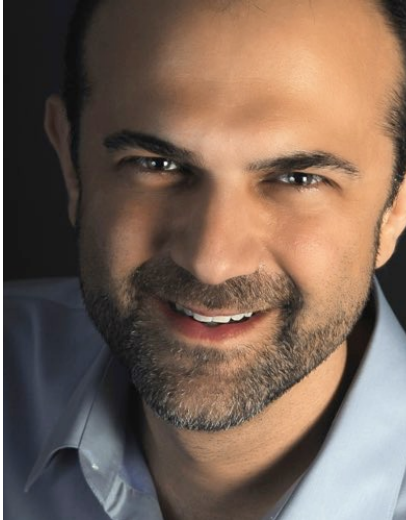
High resolution photo available at youmustconform.com

2084 is an epic sci-fi comedy that was shot in my living room with a cast of three, a crew of less, and a budget barely big enough for pizza. But, I'm getting ahead of myself.